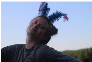
Special Events Coordinator