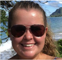
Water Front Director